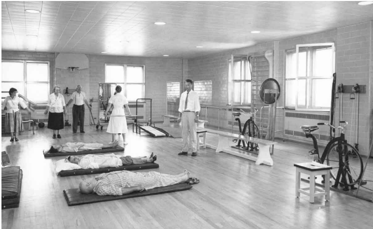
Gym - Rehab & Physical Medicine, Toronto General Hospital, Gerard Wing., ca. 1958.

treatment of the patient, but they may also be used in: the continuing care of the patient: