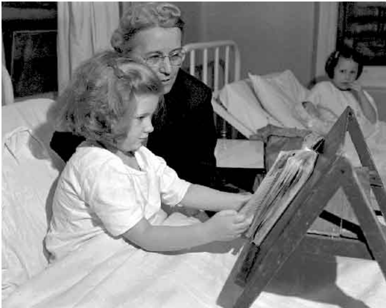
Spastic Child Reading, Children's Hospital, Vancouver, 1949.

All health-related organizations are a vital part of the community in which they exist. People often develop a strong attachment to the building in which they or their children were born; where they were ill and recovered; and where friends or family have died. The interaction between the hospital/clinic and the community is documented in records relating to fund-raising drives; volunteer activities; and the provision of secondary services such as grief counseling.