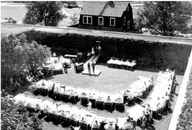
County Hospital, Saint John Annual Picnic, 1947.

Operational records are those that document the core functions of an organization. These records reflect the way organizations develop and grow. They document essential activities, decisions, legal obligations and responsibilities. Many of these have long-term or permanent value. Examples of these records are policies and procedures, minutes of Board of Directors and important committees, records of assets, legal agreements, etc.