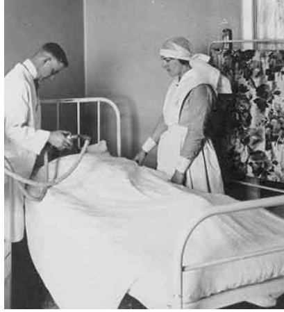
University Hospital, Doctor, Nurse, patient, 1926

Archival records are of primary importance to those within the institution which initially created and used them. They will be used by those in the legal, personnel and public relations departments, the Board of Directors and the medical staff. The policies, facts and figures the records contain can be quickly retrieved, and the reasons for decisions can be easily reviewed.