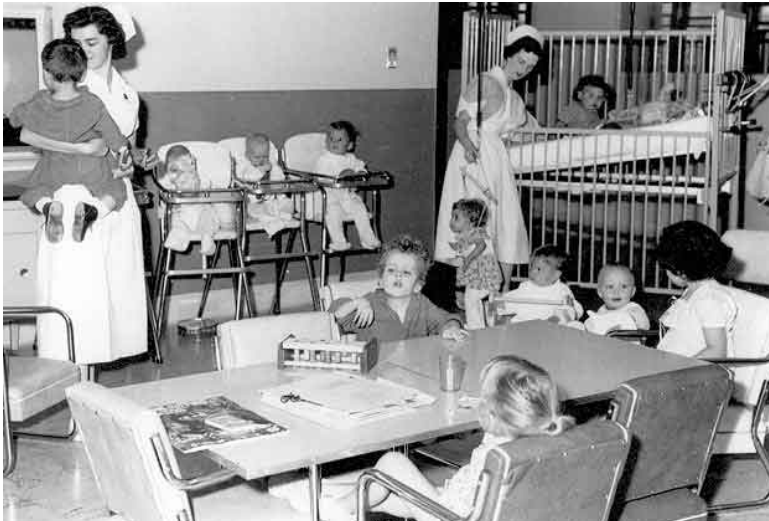
University Hospital: Pediatrics Wing, 1957

There are two major types of hospital records. Patient or medical records are usually very well organized, because they are normally under the control of staff who have formal training in managing patient information, i.e. “the chart”. As well, retention periods for these records are usually legislated, meaning that they can be disposed of, in whole or in part, on a regular basis. The primary use of these records is to facilitate the immediate