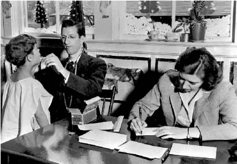
Medical checkup, Lumby School, North Okanagan, 1945.