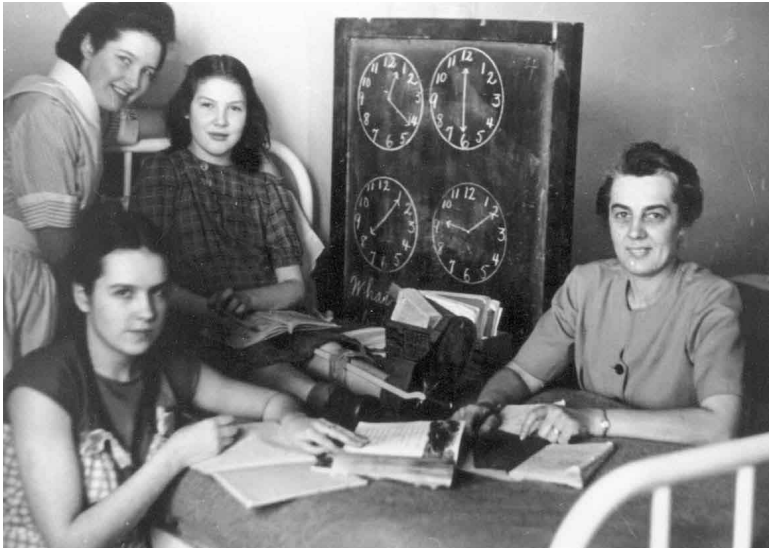
Children being instructed in school work at Polio Clinic, ca. 1943.