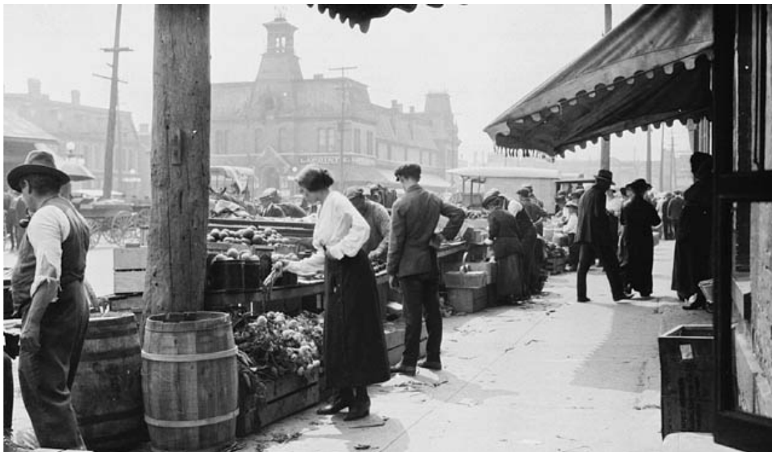
View of the Byward Market.

Enjoy an evening with friends and colleagues in the beautiful ballroom of the Chateau Champlain – dancing with some additional special entertainment to be announced soon!