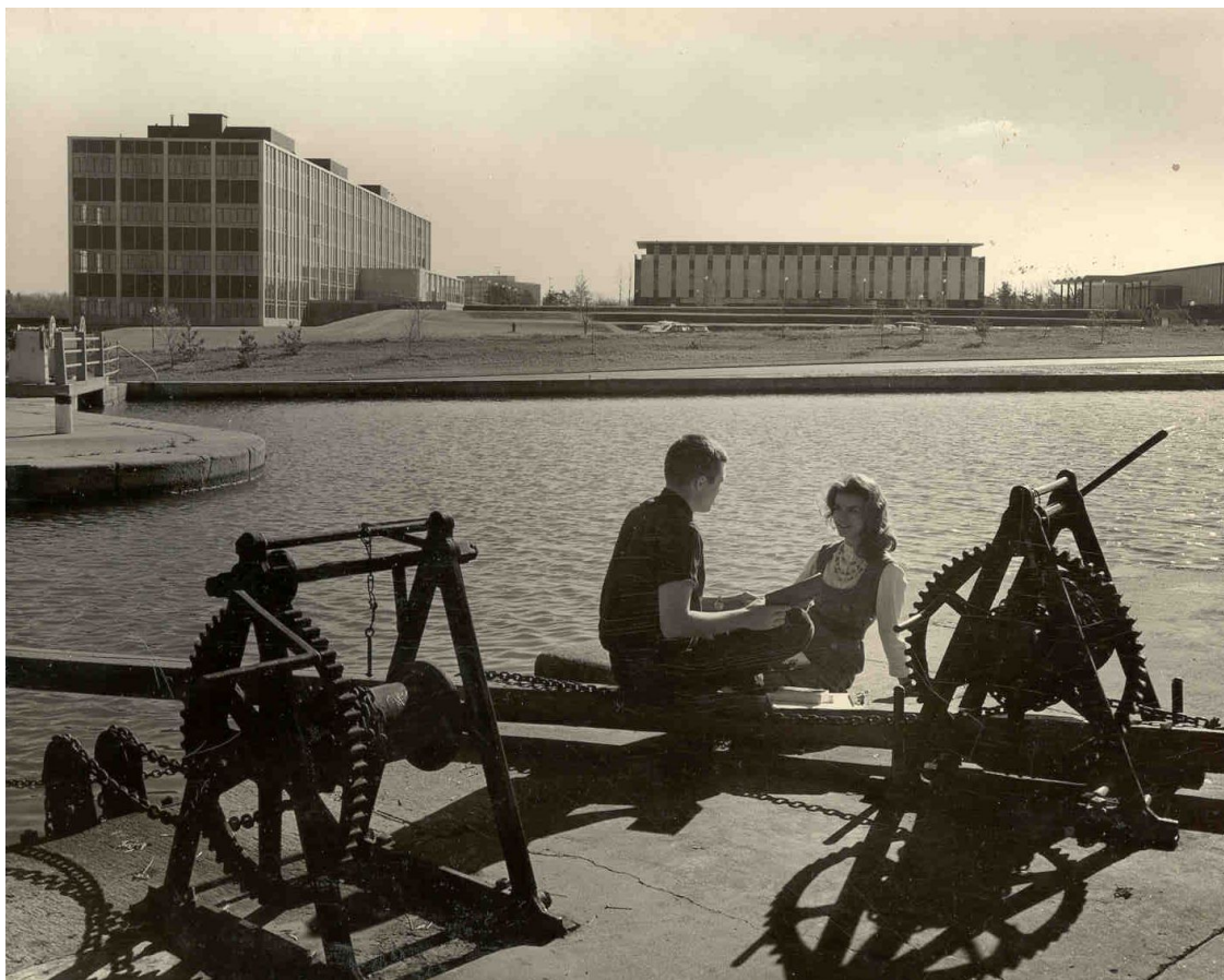
Archives & Research Collections - Carleton University, Campus Views, 1960

The session features three presentations on different aspects of digital disruption: preservation of digital music recordings, archivists' early responses to technology, and international research on trustworthy records.