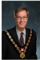
Jim Watson Mayor/Maire