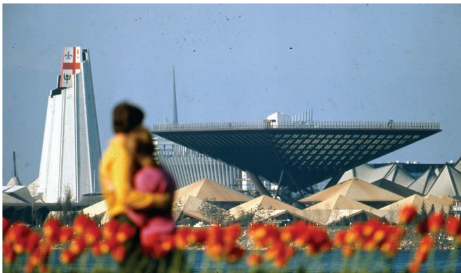
Terre des Hommes, pavillons de la Grande-Bretagne et du Canada. - 1968.

Enjoy an evening with friends and colleagues in the beautiful ballroom of the Chateau Champlain – dancing with some additional special entertainment to be announced soon!