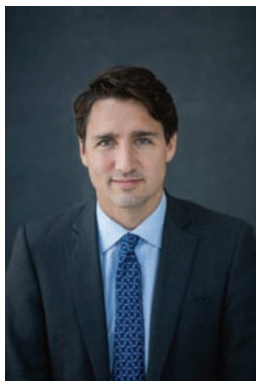
The Rt. Hon. Justin P.J. Trudeau, P.C., M.P. Prime Minister of Canada