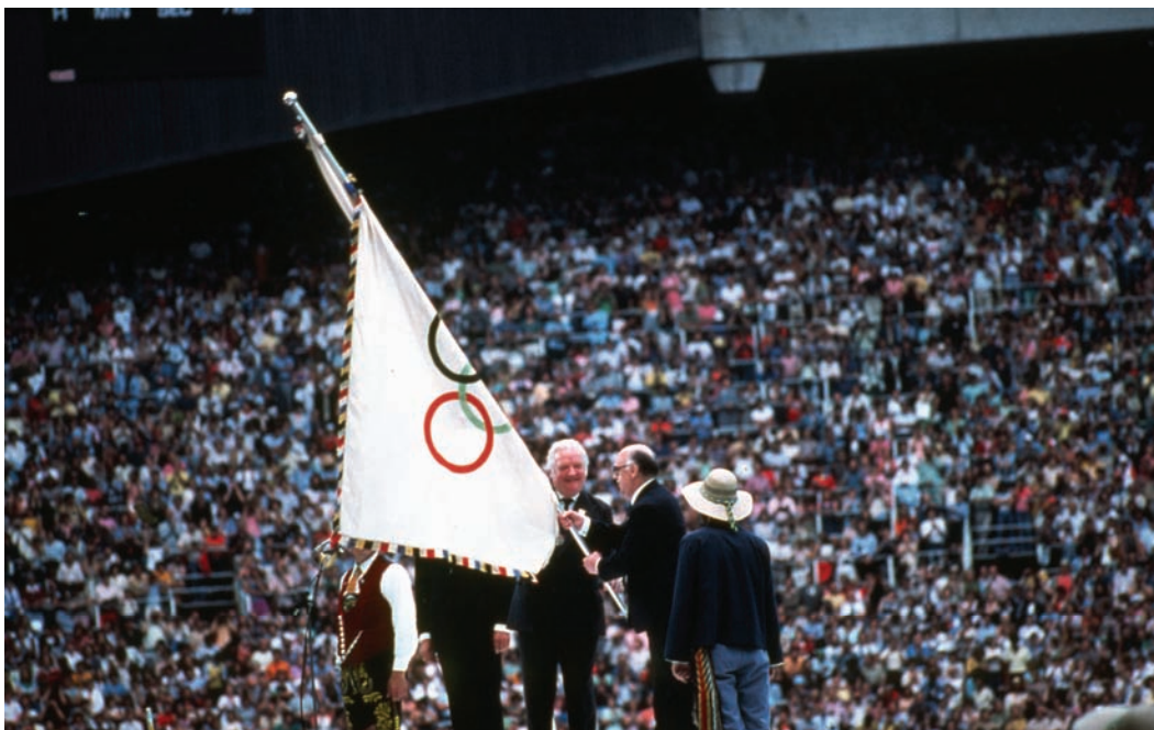
Cérémonies d'ouverture des Jeux olympiques de Montréal, en présence du maire Jean Drapeau. - 1976.

We regret that those not registered for the conference as well as those who register onsite cannot be included for the lunch service.