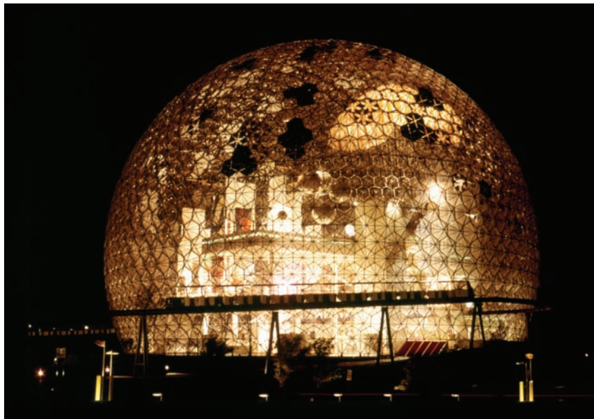
Expo 67 (pavillon des États-Unis). - 1967, Photo courtesy of Archives de la Ville de Montréal.