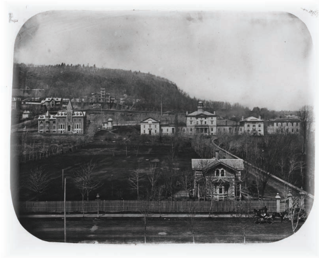
McGill University campus, ca. 1870.