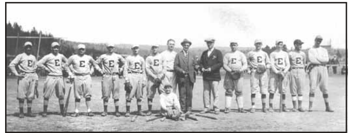
Club de baseball d'Edmundston en 1925

Just 6 short blocks out the front door of the Crowne Plaza Hotel, heading south towards the hill, is Queens Square, site of the ball game. It's Fredericton – even the blocks are small! The number of fans has been growing yearly, so come and be a part of the fun. Play, or just watch, as Beyea and Brandak come up with yet more devilish tricks to continue the East-West rivalry. The early line has the veteran East team favoured over the younger Western rivals owing to some defections to the dark side – records management; but don't believe it,