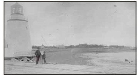
Lighthouse, Saint Andrews, N.B. ca.1895