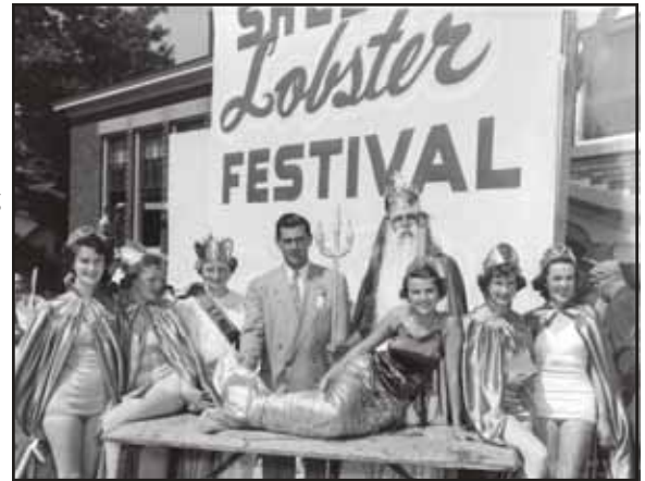
Lobster dinner, P225-538 Maurice Richard and princesses at Shediac Lobster Festival, ca. 1950s

Please note: an alternate meal will be available – please indicate when you register.