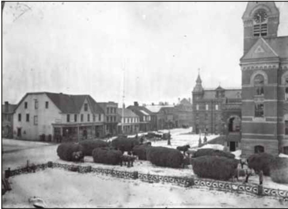
View from Normal School roof of winter market at City Hall, ca. 1875