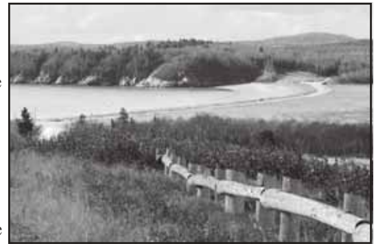
NBM-F25-41 Saints Rest Beach, Saint John, N.B.

Business meeting of the ACA, including presentation of reports and audited statements, election of two directors, approval of budget and consideration of the Bylaw amendments.