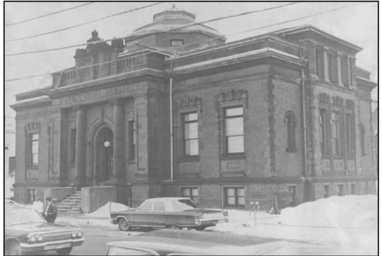
"Old Library Exterior" - Carnegie building on Hazen Ave., Saint John, N.B.