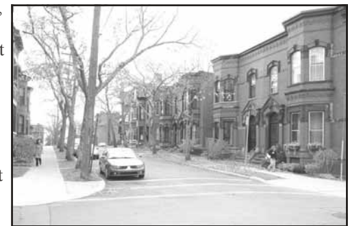
NBM-F25-8(2) Germain St., Saint John, N.B.