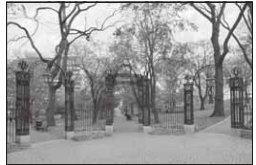
NBM-F25-50 Loyalist Burial Ground, Saint John, N.B.