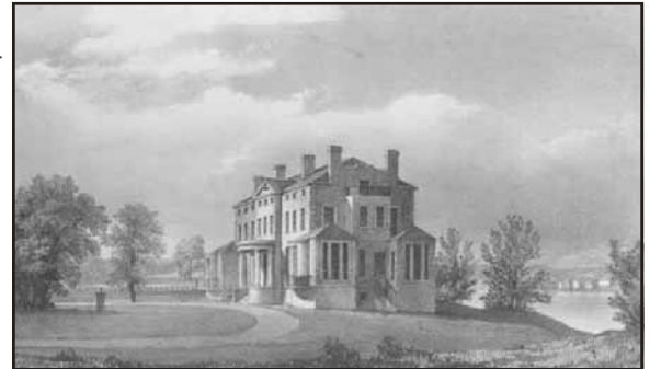
W 573 "New Government House", Fredericton, N.B.

Sponsor: the Gala is generously supported by the Lt. Governor's office and Provincial Archives of New Brunswick.