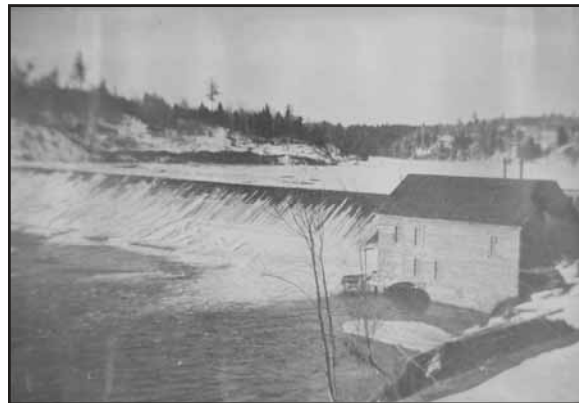
The hydro-electric project on the Meduxnakeag.