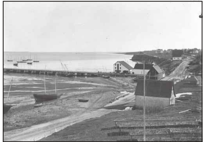
Harbour and shore at Caraquet, N.B., ca. 1900