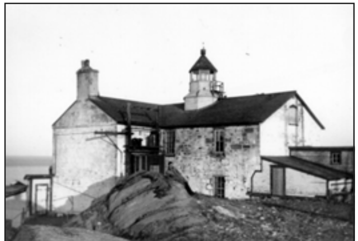
Photo 6: Fort Amherst Lighthouse

Sponsored by: Belfor Canada, InterPARES Project