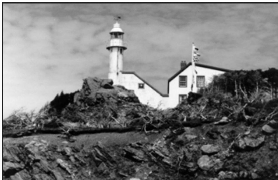
Photo 1 Rocky Harbour Lighthouse PF-055.2-H07