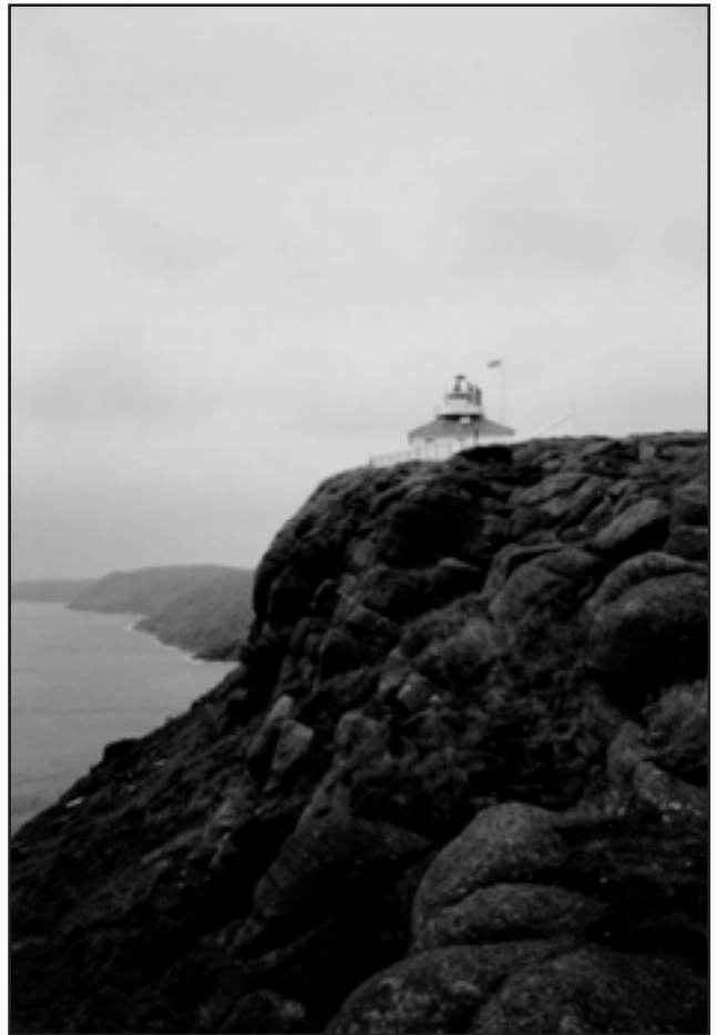
Cape Spear Lighthouse