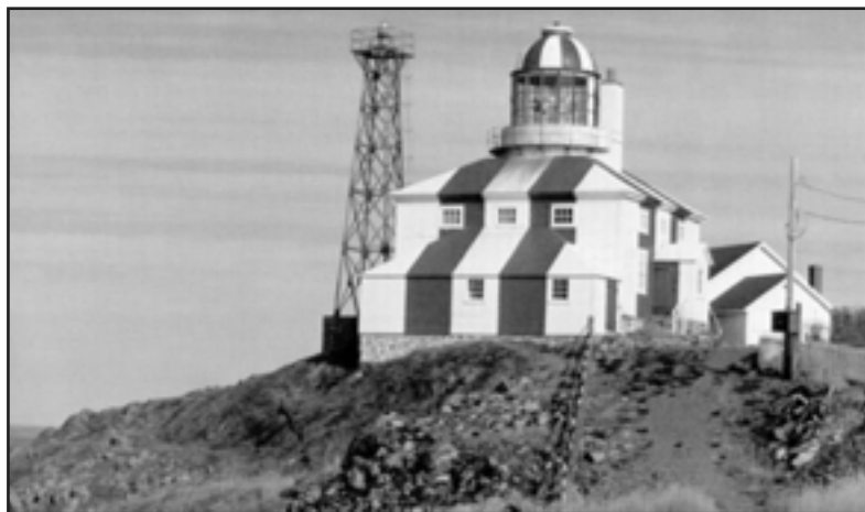
Photo 4: Cape Bonavista Lighthouse

Business meeting of the ACA, including presentation of reports and audited statements, election of two directors, approval of budget and consideration of any Bylaw amendments.