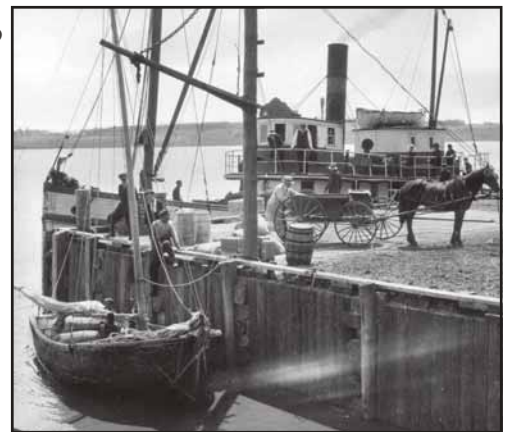
Loading, High Tide, Moncton, N.B., 1900-1920