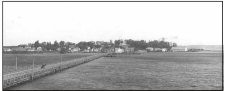
LS-AA17 Bathurst Village, Gloucester County, N.B., 1900-1920