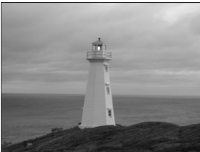
Photo 2 Cape Spear lighthouse, 53077050_62c072c90e